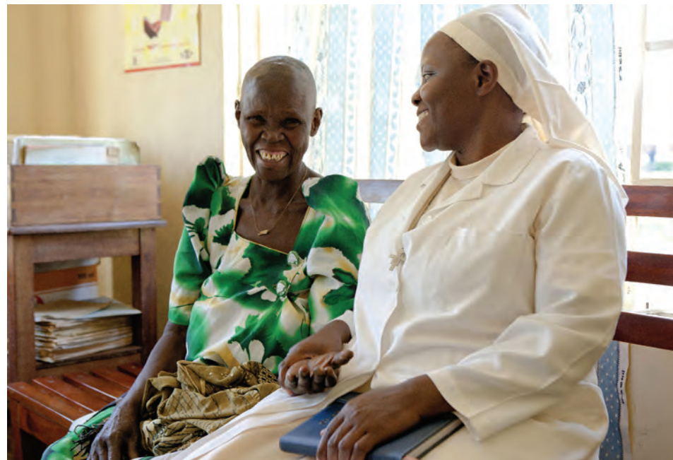
Asserting the right to health: overcoming discrimination.

Here in Austria, it's a question of making 'the good life for all' a reality. As a result, we work with schools, parishes, doctors' surgeries and hospitals. We share our experiences to create an open view of the world.