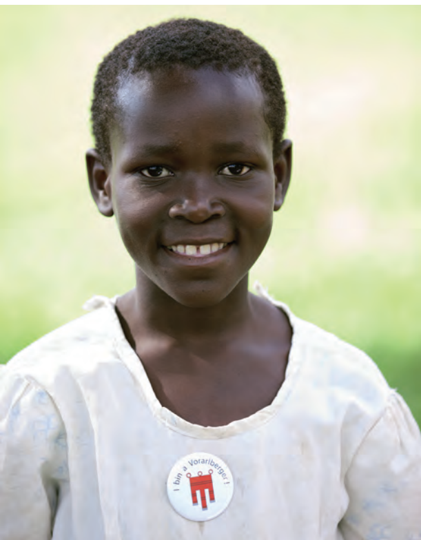
We share same values with people of many different beliefs and diverse cultural backgrounds.