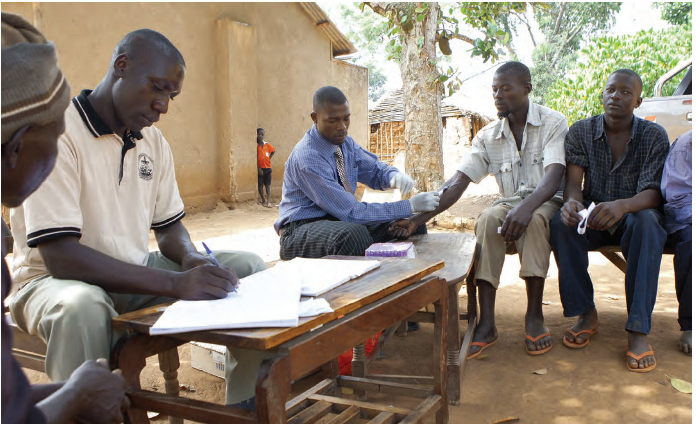
Asserting the right to access to medical care.