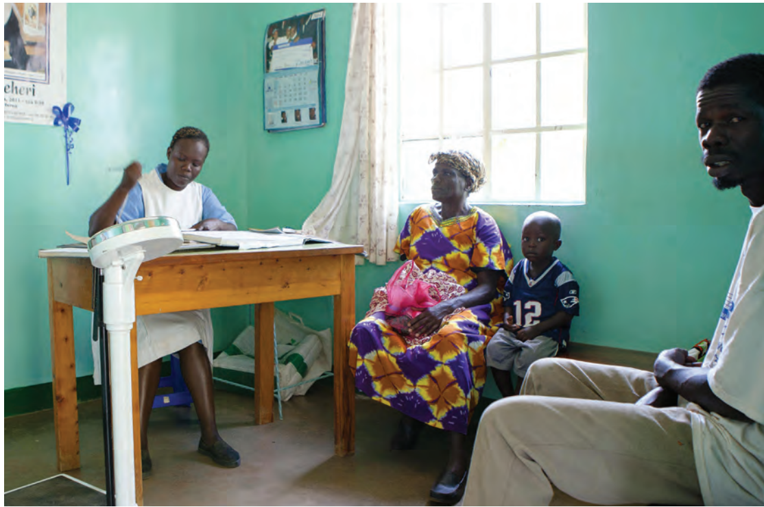
Asserting the right to access to medical treatment.